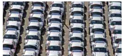
NTN-SNR Group supplies the world's greatest automobile manufacturers.

« ASB®, which is now the benchmark sensor bearing, is of course a symbol of our spirit of commitment. It has brought real added value to the bearing as a component, and driven car design forward. But the NTN-SNR Group OEM product range is not limited just to wheel bearings. It covers a very wide range of applications: