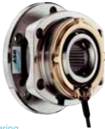
ASB® wheel bearing with sensor-holder and sensor.