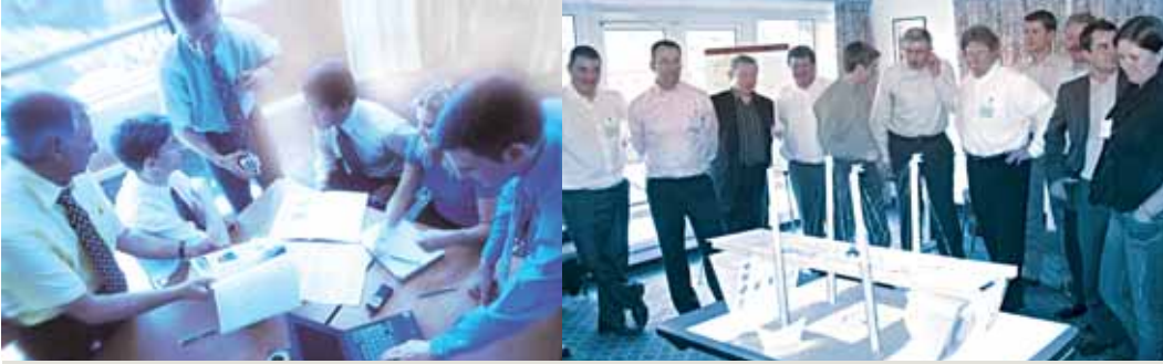
"Team Building" session between NTN and SNR.