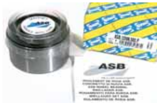
ASB® bearing with assembly instructions and protective cover.