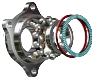
Exploded drawing of an ASB® bearing.